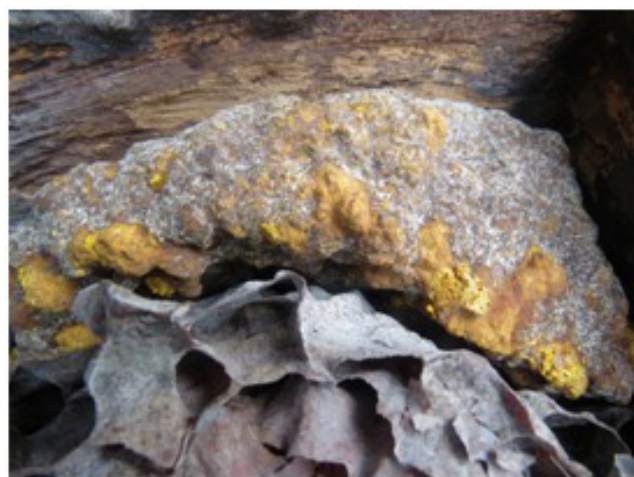
Fig. 3. Aspects of scutellum in nests of Cephalotrigona capitata from the State of Bahia.