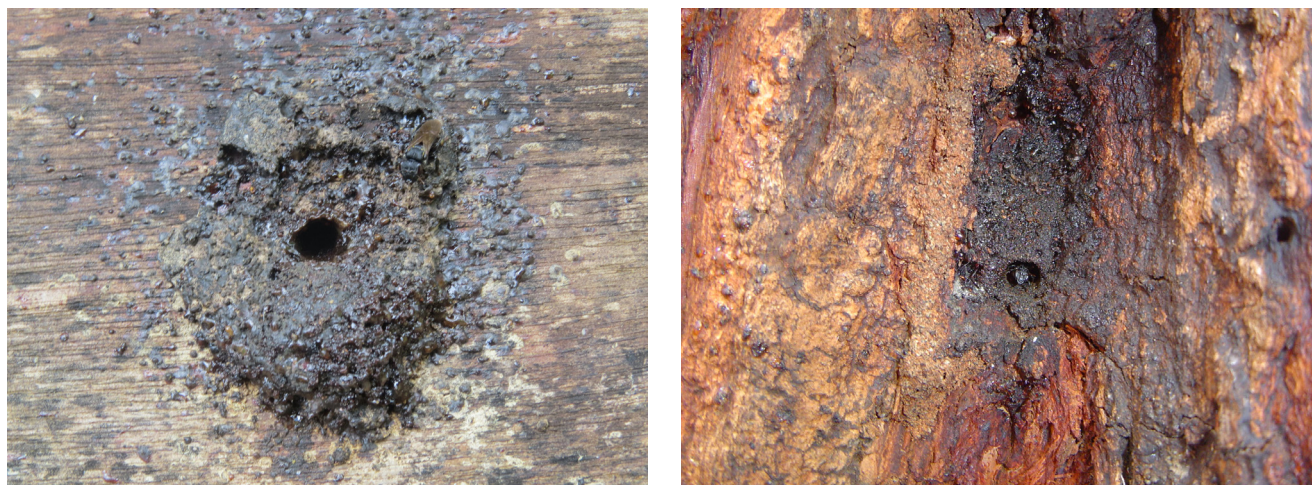
Fig. 2. Entrance of Cephalotrigona capitata nests found in the state of Bahia.

necessary for nests occupying live trees, which provide natural protection against temperature variations (Fig. 3). In boxes kept in open areas, the scutellum was cudgel-shaped, being located at their upper parts and directed to the main wind flow. No bees were observed leaving the nests with waste.